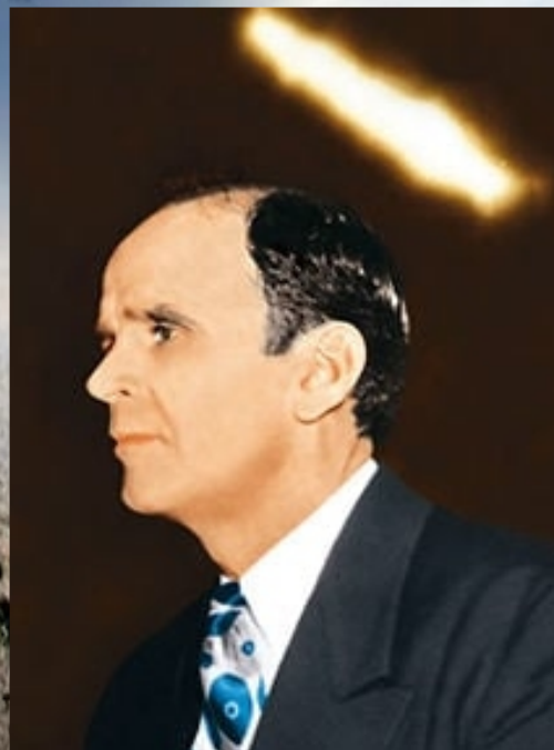
WILLIAM M. BRANHAM ELIJAH-PROPHET